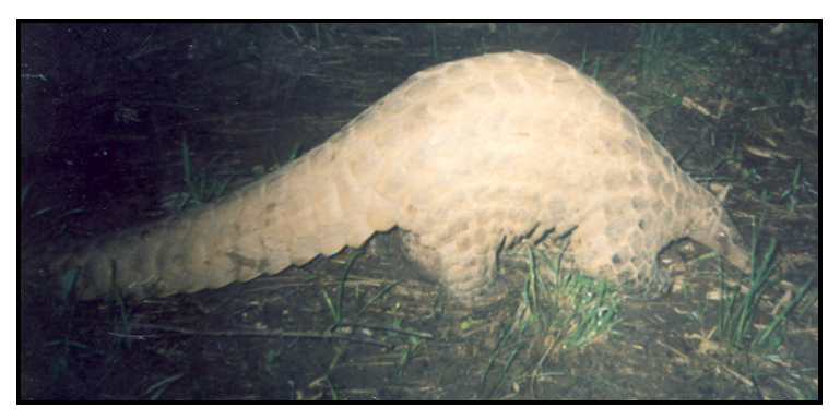
Fig. 5 First authenticated record of Giant Pangolin in Tanzania

Tanganyika. The park was particularly interesting to us because it is a Congolese forest remnant and many parts of the park had been poorly surveyed. The logistics of working in these isolated areas is considerable and Chediel Kazaeli and Zawadi Mbwambo took three days to get to the site using a combination of vehicles, trains and boats. The team spent two months in the park, where they used a random trapping protocol to survey three different habitat types; thick forest, a mixed forest-grassland site, and a montane site dominated by bamboo. A total of 659 mammal sightings representing 24 mammal species were recorded during the study. Many interesting species were recorded including Bushy tailed porcupine (Atherurus africanus), a Congolese forest species seldom recorded in Tanzania, Cape clawless otter (Aonyx capensis), a new species for the park, and Aardvark (Oryxteropus afer). However the most exciting finding was of Giant pangolin (Smutsia gigantea), the first confirmed record of this species for Tanzania (Fig. 5). We had seven records of this species and the high trapping frequency suggests that they are relatively common in the area, suggesting that Mahale may prove to be one of their conservation strongholds in Africa.