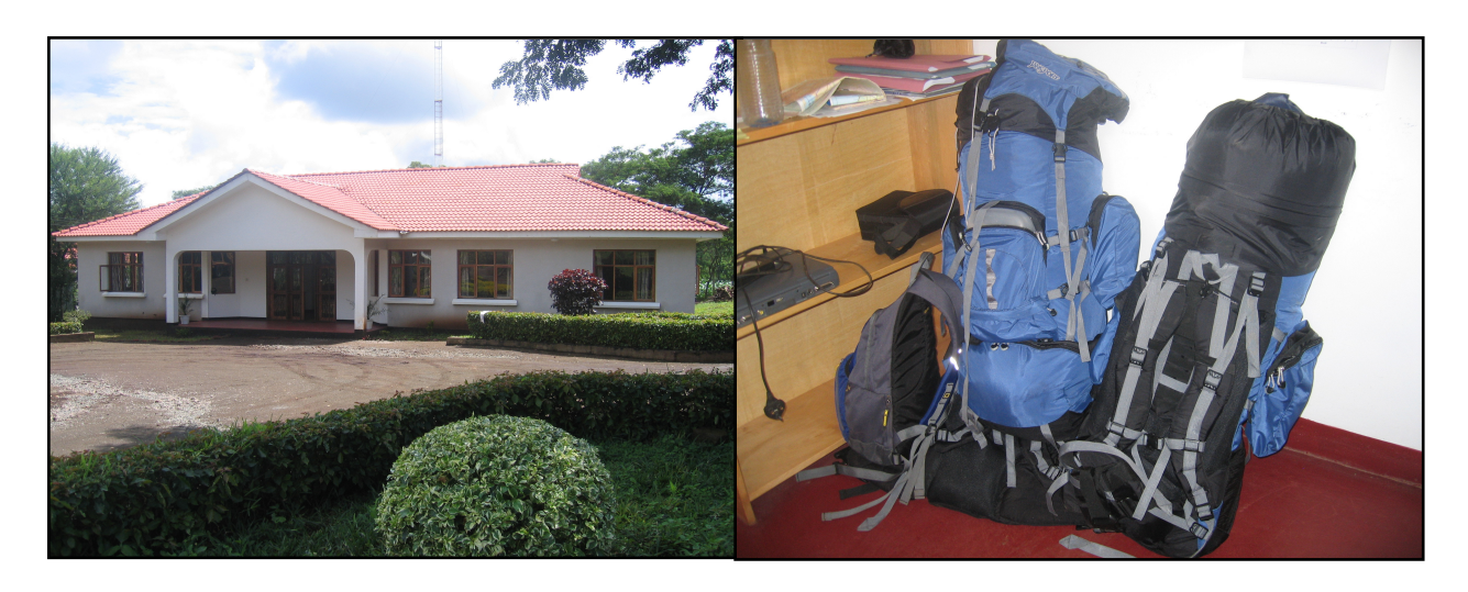
Fig. 2 The Carnivore Centre office at TAWIRI in Aruhsa, where the project is based.

A Landrover TDI station wagon has been purchased and is being shipped with a consignment ordered through Frankfurt Zoological Society, who are very kindly arranging a waiver of the import duty and VAT on the vehicle. The vehicle was budgeted in the original Tanzania Mammal Atlas Project grant, however the budget did not include import duty, hence the agreement with FZS and the resultant delay in acquiring the vehicle. The project is currently using TCP's Toyota pickup, originally purchased second hand in January 2003, and which was recently repaired following major engine problems. It was also loaned two project landrovers from the Tanzania Cheetah Conservation Program over the reporting period which have been a considerable help with field surveys. We are now seeking to purchase larger rims and tyres for the pickup to make it more bush worthy, which means that it can also serve as a back-up field vehicle for occasions when the new Landrover is not available. A large amount of camping equipment was needed for the field survey work most of which has now been purchased. This includes large rucksacks, tents, sleeping gear, cooking gear, torches, waterproof clothing, footwear and binoculars.