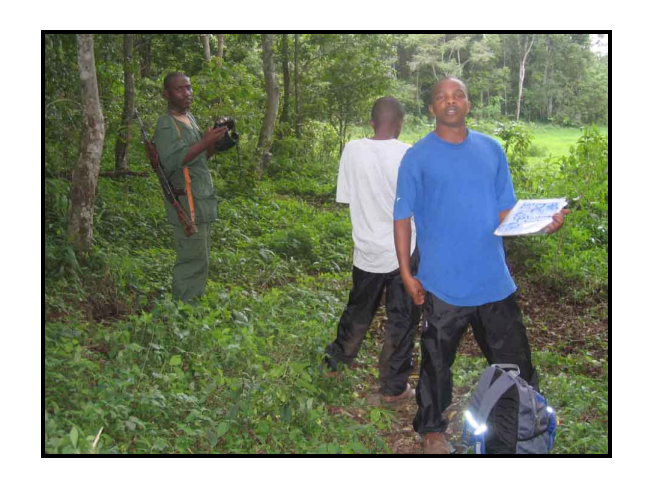
Fig.6 Camera trapping survey team at Arusha National Park which started in Mid March 2006